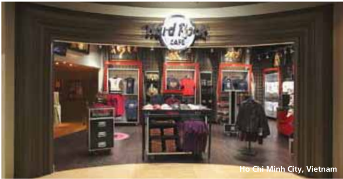
Ho Chi Minh City, Vietnam