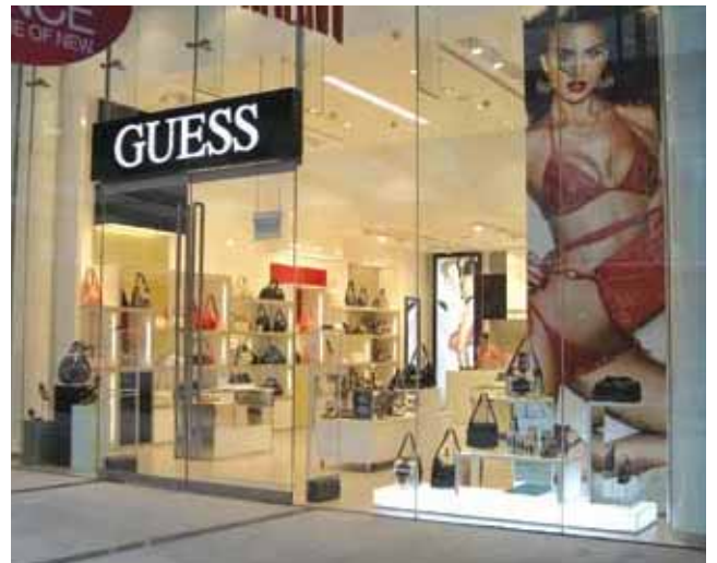
Orchard Road's tallest vertical mall, orchard central offers a unique retail experience for urban shoppers. Kingsmen worked with repeat clients for the design and/or construction of some specialty stores and eateries like Desigual, GUESS Accessories, THE HOUR GLASS and dessert haven, HEAVEN'S LOFT.